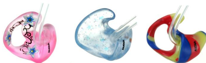
Figure 3. A sample of the variety of colors, swirls, and glitter available in pediatric earmolds