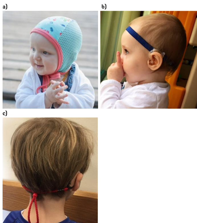
Figure 11. Retention solutions for babies include: a) pilot cap with mesh sides b) headband with sleeves, c) retention straps. Images used with permission from Emmifaye, Handmade clothing for children at https://www.etsy.com/shop/emmifaye and Ear Suspenders at https://www.etsy.com/shop/EarSuspenders .

important to ensure that the portion of the cap that covers the ears is made of a material that is not too thick creating feedback or reducing the amount of sound entering the microphone of the hearing aid. Figure 11a shows an example of a pilot cap made partially with a mesh material used for this purpose. A newer solution that many families have found useful is a stretchy headband that has a rubber holder attached to the headband to hold the hearing aid in place above the ear (Figure 11b). Once children are walking, many families find that a simple retention strap as shown in figure 11c is helpful. Whatever strategy is used, as with selection of earmold colors, the one that is used most and ensures that children are wearing their hearing aids during all of their waking hours is the best choice.