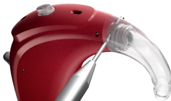
Figure 6. The Phonak tamperproof earhook being unlocked with the tool

Both standard and mini earhooks are available with a 680 filter to provide a smoothed frequency response in this frequency region. This filter is recommended because it smooths peaks that lead to feedback and makes it easier to optimize the maximum power output (MPO) of the device (Scollie & Seewald, 2002). It is important to note that these acoustic damping elements are made of absorptive fibers that can get damp or clogged. A water-logged filter can produce a muted response or even block the sound channel all together, leading one to believe that the hearing aid is nonfunctional. When troubleshooting, it is important to remove the hooks to ensure that the filter is not impeding performance. All Phonak BTEs are compatible with a mini earhook and tamperproof mini earhook. For additional piece of mind, all Phonak tamperproof accessories are designed to prevent small hearing aid parts from being removed and ingested by children and to comply with IEC standards. A small tool is needed to unlock the pediatric tamperproof earhook from the BTE (Figure 6). The earhooks are available in 6 colors (Figure 7) to make the selection of hearing aids more fun and appealing to children. They can also be changed at home and are an inexpensive way to personalize the hearing aids.