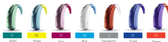
Figure 7. Phonak standard and tamperproof mini earhooks are available in 6 colors and a transparent option to personalize pediatric hearing aids.