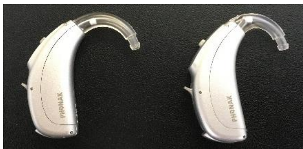
Figure 5. A BTE with a standard HE 10 680 hook (left) and a HE 10 680 mini hook (right).

Both standard and mini earhooks are available with a 680 filter to provide a smoothed frequency response in this frequency region. This filter is recommended because it smooths peaks that lead to feedback and makes it easier to optimize the maximum power output (MPO) of the device (Scollie & Seewald, 2002). It is important to note that these acoustic damping elements are made of absorptive fibers that can get damp or clogged. A water-logged filter can produce a muted response or even block the sound channel all together, leading one to believe that the hearing aid is nonfunctional. When troubleshooting, it is important to remove the hooks to ensure that the filter is not impeding performance. All Phonak BTEs are compatible with a mini earhook and tamperproof mini earhook. For additional piece of mind, all Phonak tamperproof accessories are designed to prevent small hearing aid parts from being removed and ingested by children and to comply with IEC standards. A small tool is needed to unlock the pediatric tamperproof earhook from the BTE (Figure 6). The earhooks are available in 6 colors (Figure 7) to make the selection of hearing aids more fun and appealing to children. They can also be changed at home and are an inexpensive way to personalize the hearing aids.