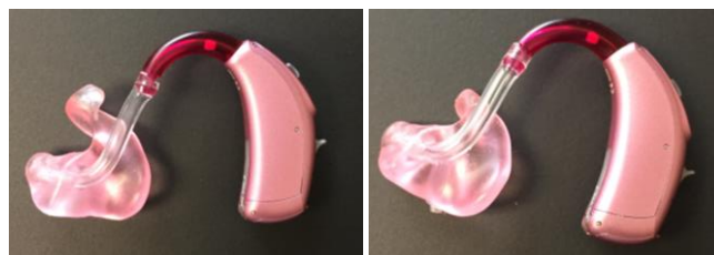
Figure 2a. Shell earmold with (left) and without (right) helix.