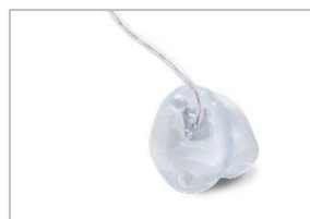
Figure 10. The custom cShell encloses a canal receiver in a custom housing with a sealed faceplate.

When a RIC is selected for an older child or teenager, the fitter again has the choice of standard open, closed and power domes or custom tips. For maximizing gain and output, a custom cShell option (Figure 10) is also available. The cShell includes a custom earpiece with a closed faceplate, similar to a completely-in-canal (CIC), but with a wire running to the behind-the-ear portion. This coupling is recommended when a RIC is used for hearing losses exceeding 50 dBHL. Venting can be specified. Due to the delicacy of the wired component and the fact that the receiver cannot be changed in the field (due to the sealed faceplate), the RIC and cShell solution should only be considered when the hearing aid will be managed by someone who can accept the additional care and handling required. With these considerations in mind, RICs are not the best option for an infant or young child.