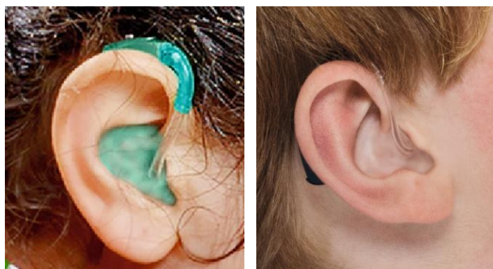
Figure 8. Traditional earhook and tubing on the left. SlimTube pictured on the right.

compromises. Maximum gain and output is reduced 5-10 dB with the SlimTubes compared to the HE 10 680 standard earhook. The standard SlimTube is offered in sizes 0-3 and the Power SlimTube (compatible with Naída and Sky SP and UP) is offered in sizes 00-3. Size 0 generally works for children down to about 7 years of age. Since a SlimTube can reduce the gain and output of the device, the effects of which cannot be simulated in the coupler, it is advised to always do real ear verification of these fittings rather than simulated test box fittings using real ear to coupler differences (RECDs).