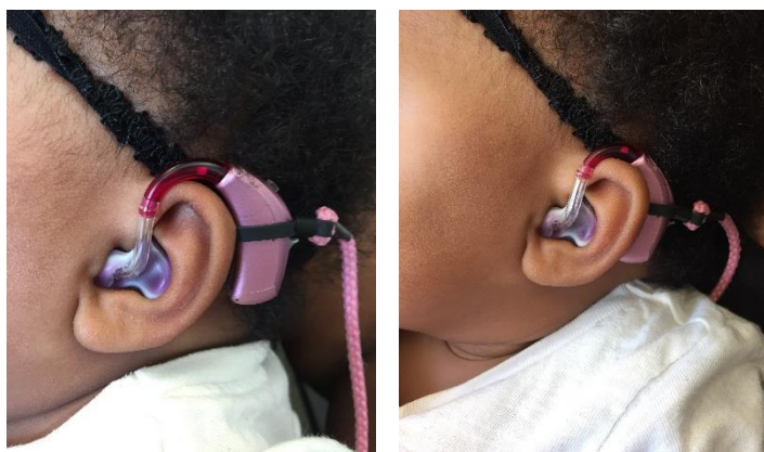
Figures 4. A loose fitting hearing aid with a standard earhook (left). An improved hearing aid fitting in which a mini earhook is used to improve positioning, retention and comfort over the ear (right).

A BTE style hearing aid requires that sound be channeled from the loudspeaker into the ear canal. Earhooks and tubing coupled to a traditional earmold are the most common coupling choices with BTE devices. Standard size earhooks often result in a floppy, loose fitting on little ears. Figure 4 shows examples of a young child with a loose fitting hearing aid with a standard size earhook and an improved fit using a pediatric size earhook. Pediatric "mini hooks" are suggested for use with infants and young children because they are shortened with a tighter curve over the ear to support hearing aid retention and optimal positioning. A comparison of the two types of earhooks is illustrated in figure 5.