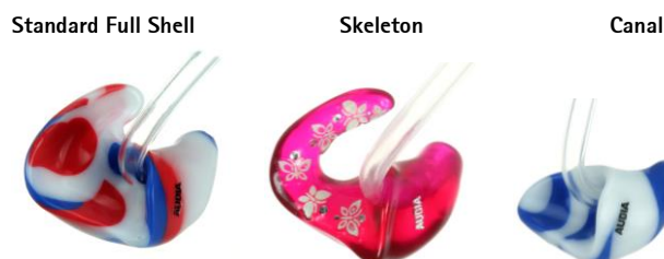
Figure 2. Earmold styles including full shell, skeleton mold and canal mold.

In the first year of life, a child may need more than six sets of earmold impressions and earmolds, so parents' expectations should be set accordingly. It is also important to note, that as the child outgrows earmolds, the acoustic properties of the ear are changing as well, necessitating new real ear to coupler difference (RECD) measurements, recalculation of targets, and adjustments of the hearing aids to maintain the same degree of audibility (Bagatto et al., 2010). Earmold venting options will often be restricted by the small size of the child's ear. Regardless of the hearing loss configuration, a vented earmold will likely not be an option early in life; however, the optimal acoustic selections for the earmold should be reconsidered as the child grows. If feedback persists in the presence of a new earmold, the audiologist may need to obtain a deeper fitting earmold down to the bony portion of the ear canal, activate the feedback management system in the hearing aid, or reassess any venting.